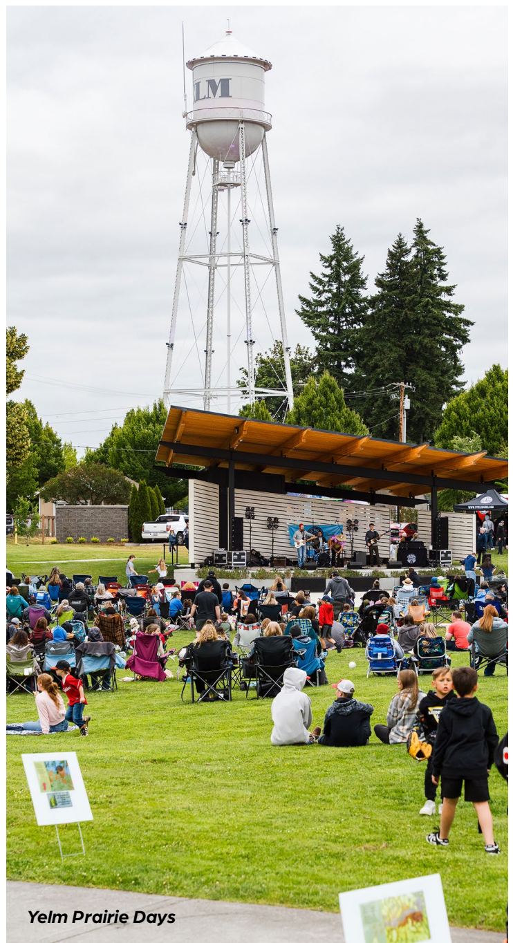
Yelm Prairie Days